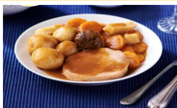
Sample roast dinner